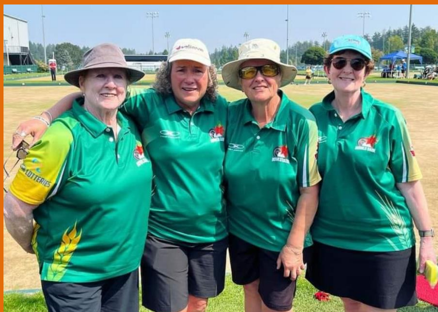
Women's Fours – Gold Medal