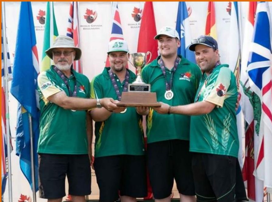
Men's Fours – Gold Medal

The Regina Lawn Bowling Club is so proud of you!